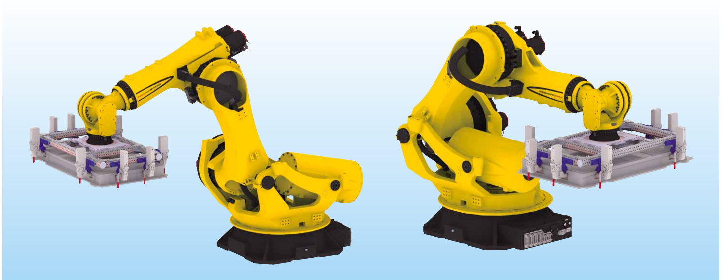
Battery Unit Handling